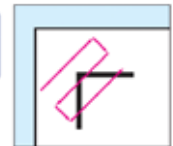
ARMS Version 5.0